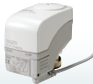
SSA81U 24 Vac Floating, Non-Spring Return Electronic Zone Valve Actuator