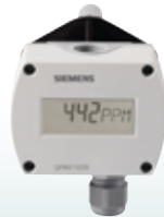
QPM2102D Duct CO2 and VOC Sensor with Display