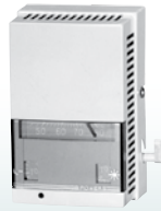
192-204 Pneumatic Room Temperature Thermostat (DA)