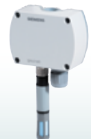
QFA3160 Outside Air RH and Temp Sensor