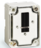
QLS60 Solar Impact Sensor