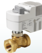
242-00212 2-Way Zone Valve Assembly, On/Off, Spring Return, 3/4" 4.1 Cv