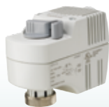
SFA71U 24 Vac On/Off, Spring Return Zone Valve Actuator