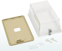
141-570 Lockable Thermostat Guard