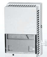
192-205 Pneumatic Room Temperature Thermostat (RA)